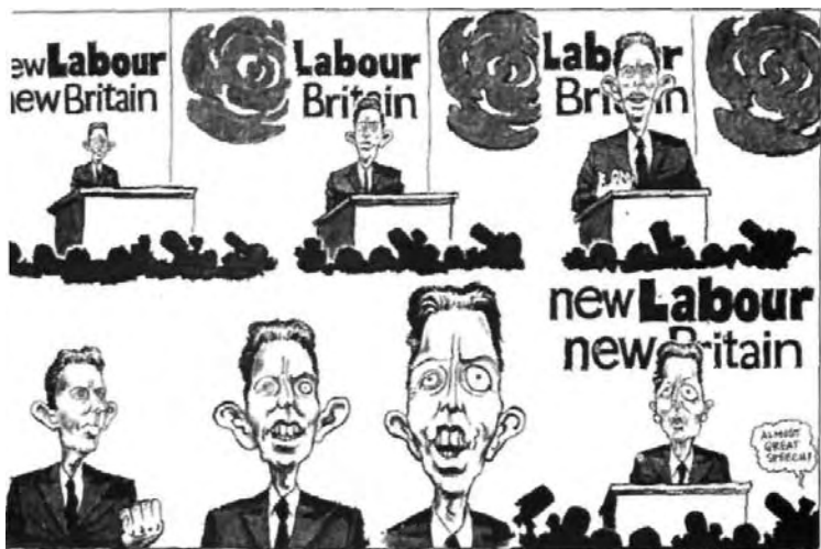
Above: Steve Bell's metamorphosis of Tony Blair into Margaret Thatcher.